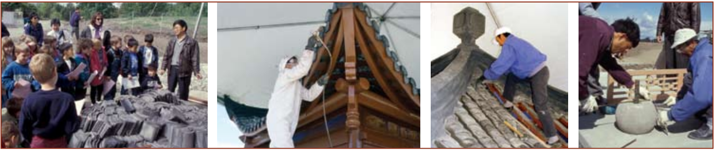
More than 1500 schoolchildren and hundreds of other visitors observed construction of Song Mei Pavilion in 1999.

Knowing the Spring Courtyard will include all the elements found in a traditional Chinese scholar's garden — water feature, trees and shrubs native to China, rock formations, intricate paving stones, lattice-work windows, covered walking corridor, an elaborate main gate, and beautiful handmade lanterns. The garden will be an exceptional venue for cultural and educational programs, seasonal festivals, and community events. We have completed the foundation, pond, walls, and the steel structures. All materials donated from China, such as wood beams and columns, paving stones, step stones, roof tiles, lattice-work windows, carved wood gates, and lanterns have been delivered to the construction site. Five well-outfitted trailers are ready on site to accommodate the artisans.